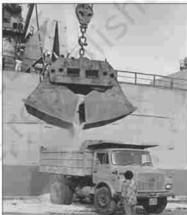
Fig. 8.3 : Unloading of goods on port

India is surrounded by sea from three sides and is bestowed with a long coastline. Water provides a smooth surface for very cheap transport provided there is no turbulence. India