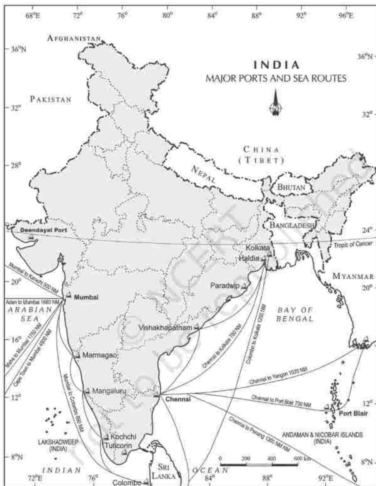
Fig. 8.4 : India - Major Ports and Sea Routes